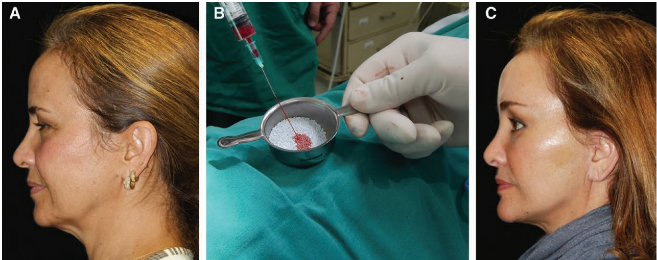
Fig. 4. Pre and postoperative aspects after mentoplasty with bioceramics and facial lifting. A, Preoperative. B, Mixing the bioceramics with patient’s blood, immediately before implantation. C, 7 months postoperative.

endonasal or subciliary approaches. This, in fact, was applied in 3 patients with congenital deformities that required augmentation of the midfacial bones, at the zygomatic-maxillary area.